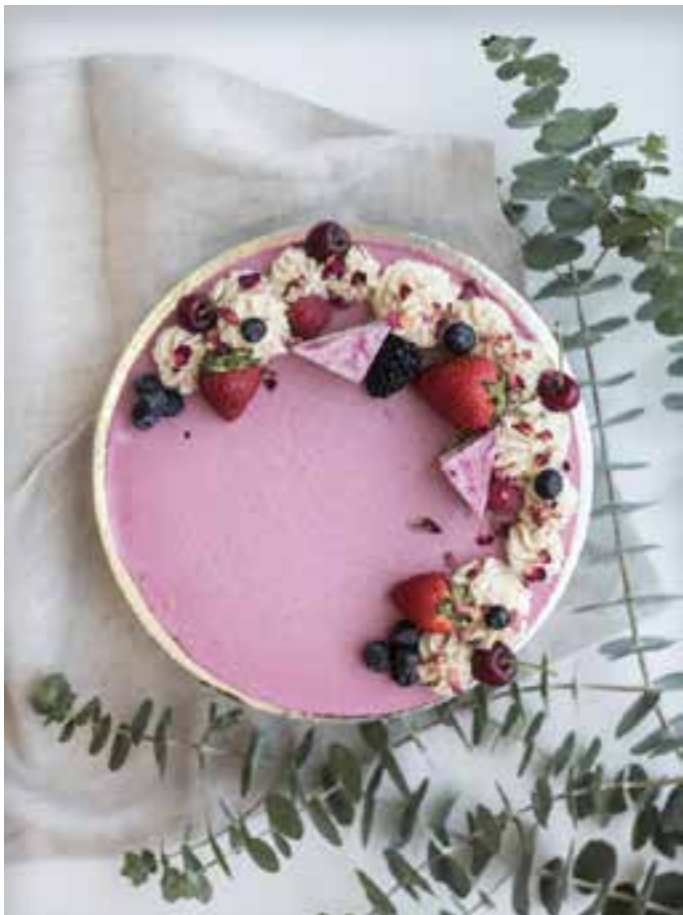
Strawberries & Cream