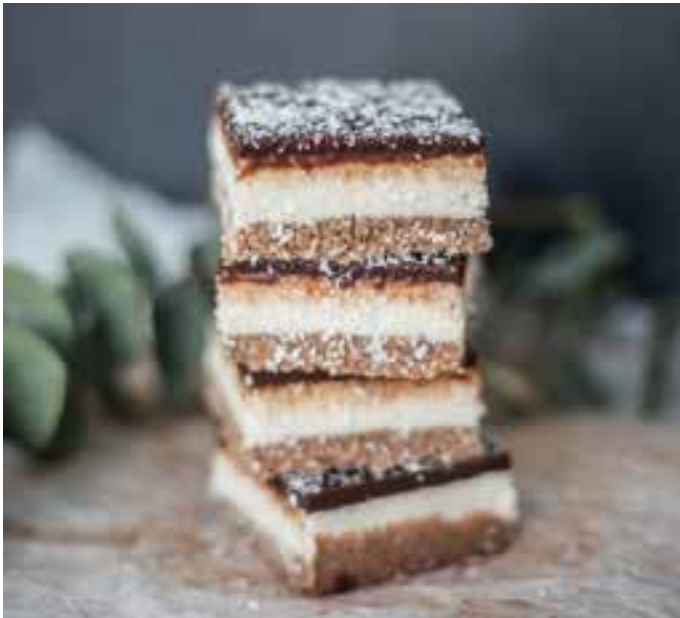
16x Raw Vegan Bounty Slices