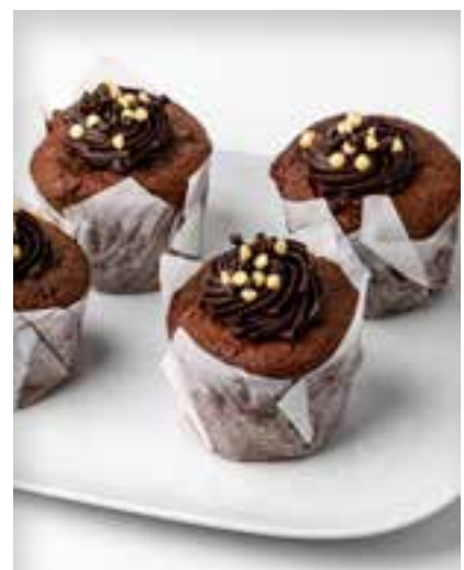
Triple Chocolate Muffin