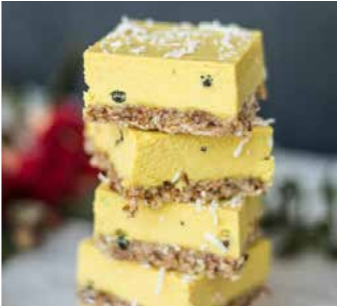
16x Passionfruit Cream Slices