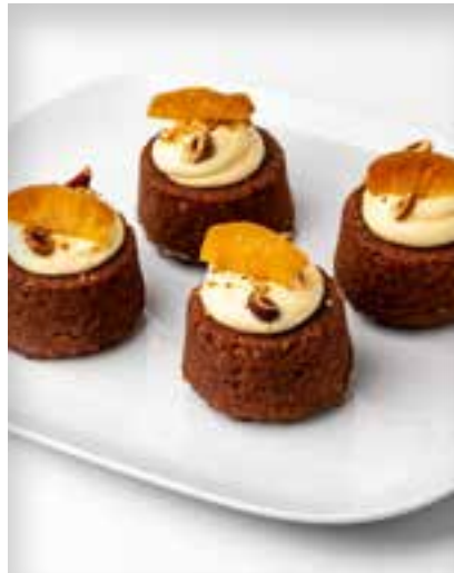
Caramelised Apple Hazelnut and Chai Cake