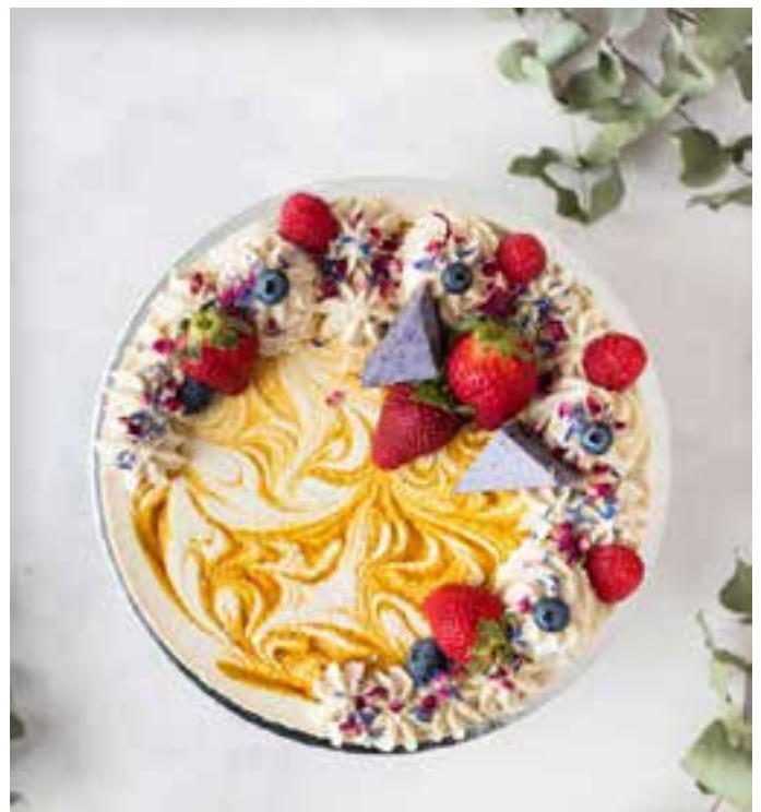
Mango & Vanilla Vegan Cake