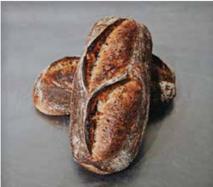
Soy Linseed Medium