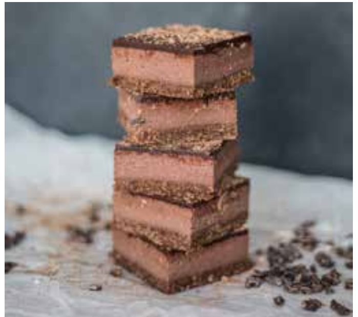
16x Chocolate & Raspberry Slices