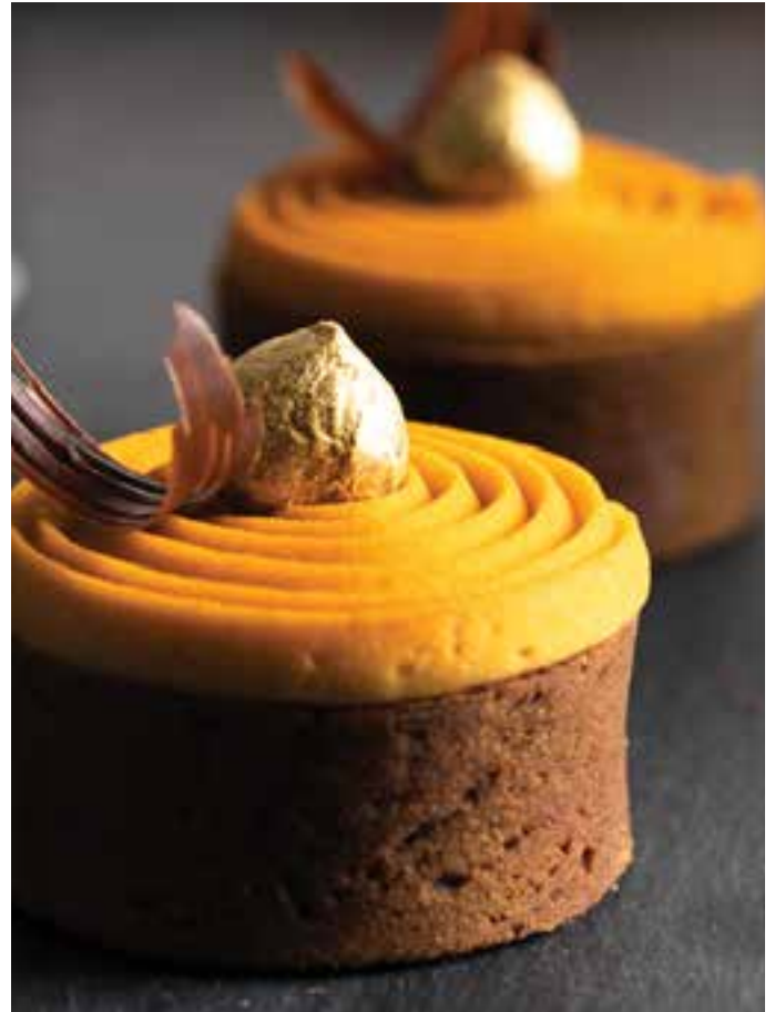
Hazelnut Praline Tart