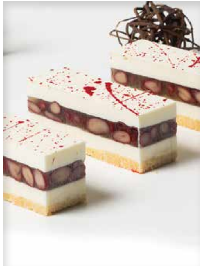
Red Bean & Coconut