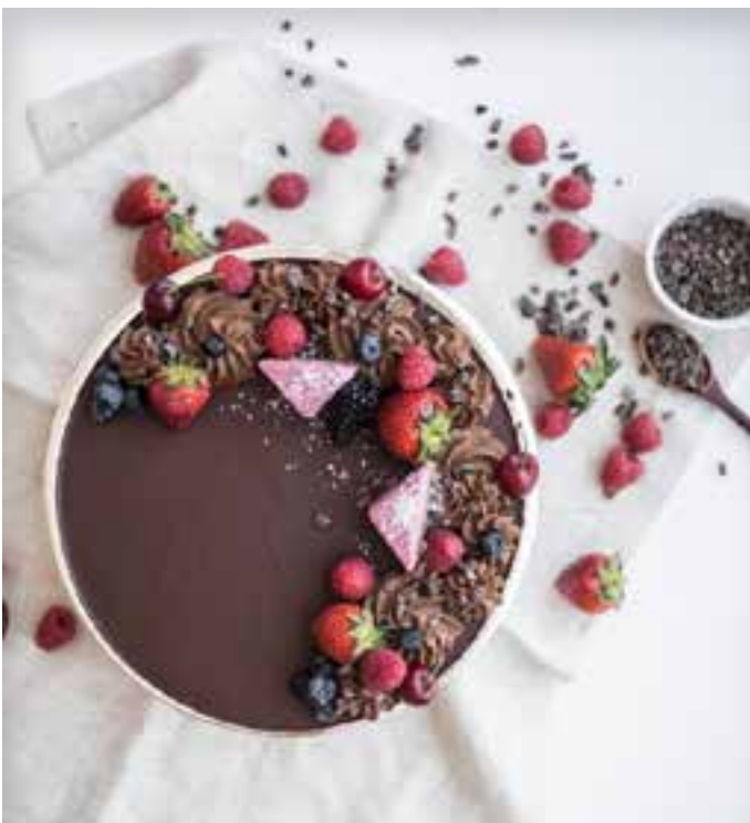
Chocolate & Raspberry Raw Cake