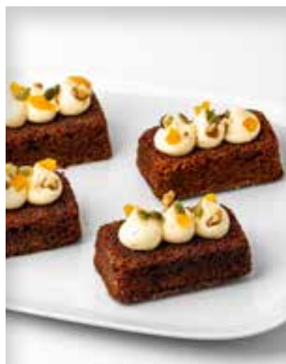
Spiced Carrot and Walnut Cake