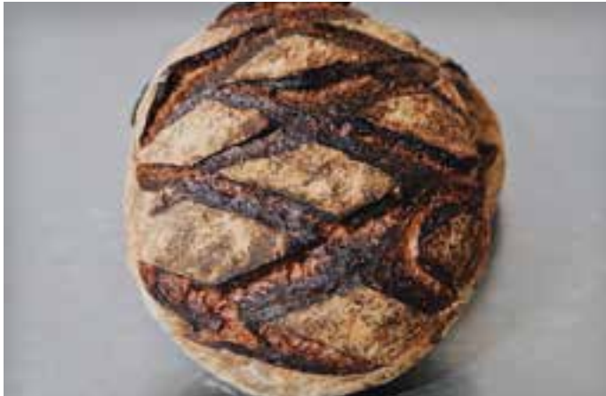
Rye and Caraway Round