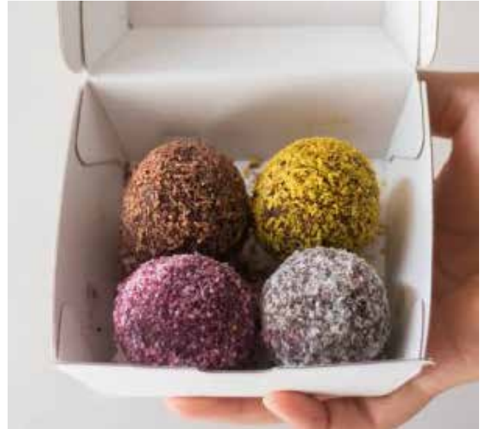
20x Protein Balls Mixed Box