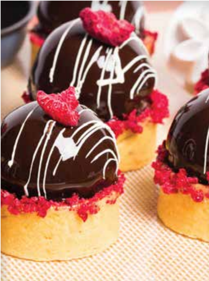
Chocolate & Raspberry