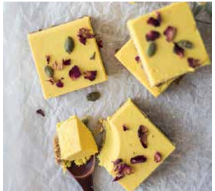
16x Lemon Slices