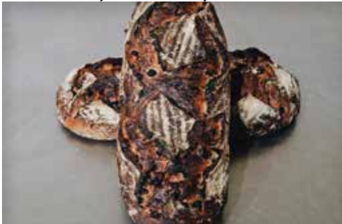
Fig And Walnut Large