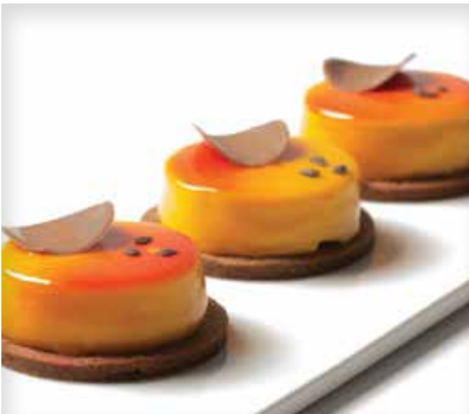
Passionfruit Sable Log