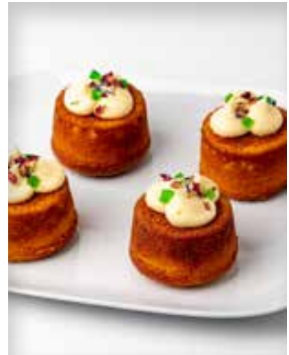
Lime Yogurt and Coconut Cake