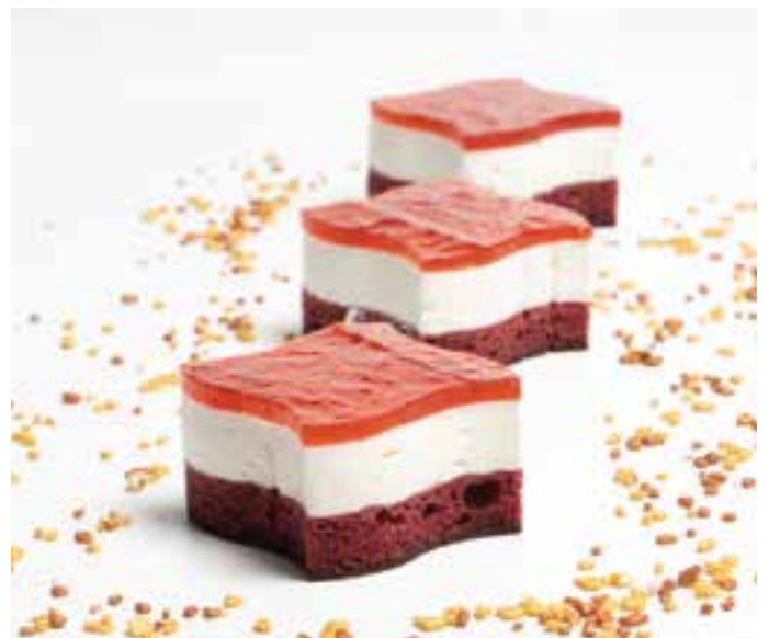
Strawberry Red Velvet 🌱