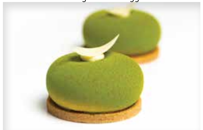
Matcha Cherry Cheesecake