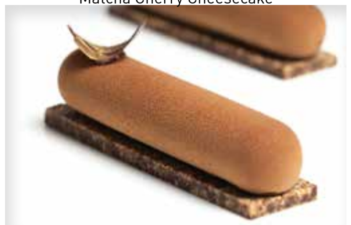
Milo Chocolate Log