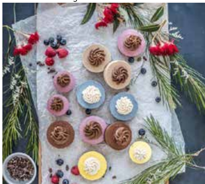
12x Assorted Raw Cup Cakes