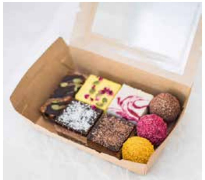
Take Home Pack – 8 Pieces