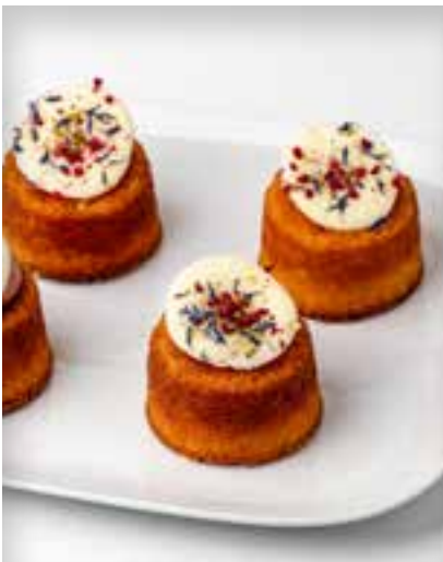
Lychee and Strawberry Cake