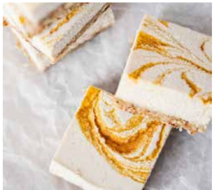
16x Mango & Vanilla Raw Vegan Slices