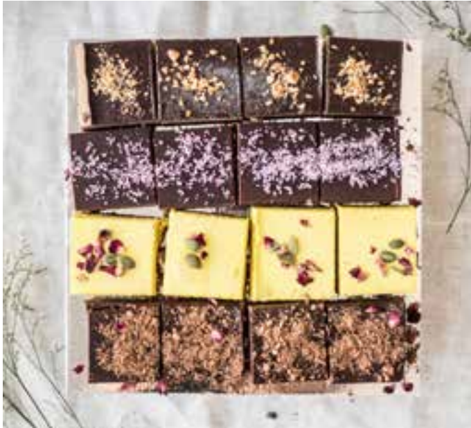
16x Assorted Raw Vegan Slices