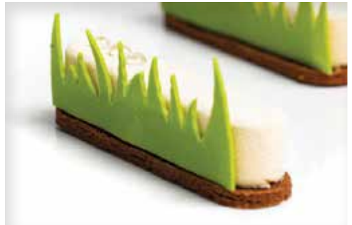
Kaffir Lime Bavarian Log