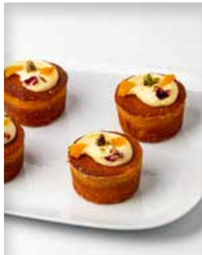
Orange and Almond Cake