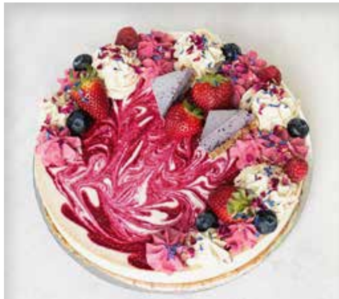
Raspberry & Vanilla Vegan Cake