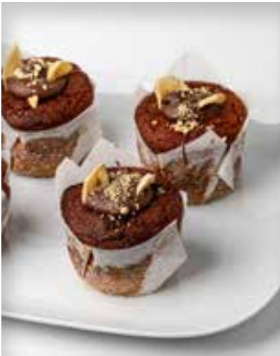
Banana Hazelnut and Nutella Muffin