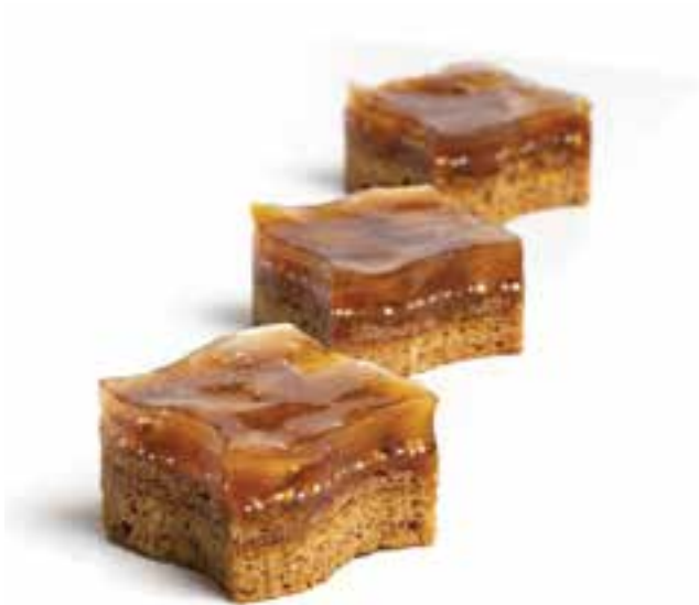
Apple Toffee 🌱