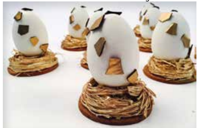
Mango Vanilla Egg