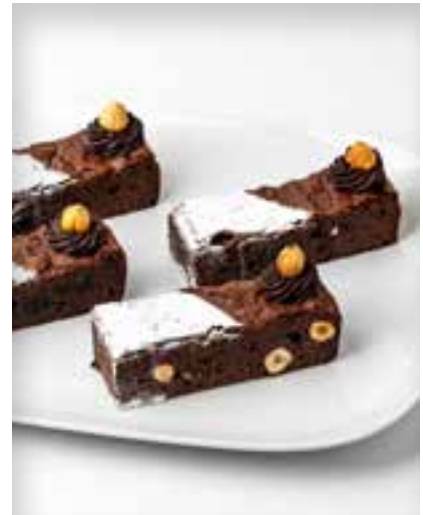
Chocolate Hazelnut and Cranberry Fudge Brownie