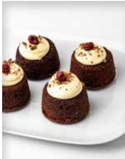
Black Forest Cake