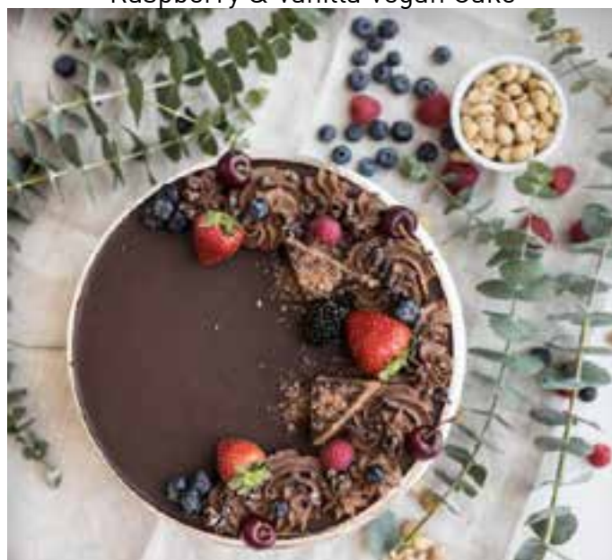
Vegan Snikers Cake