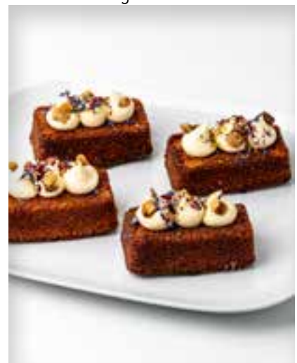
Fig and Apple Cake