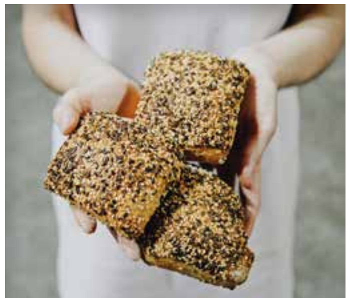
Ciabatta Seeded Mini