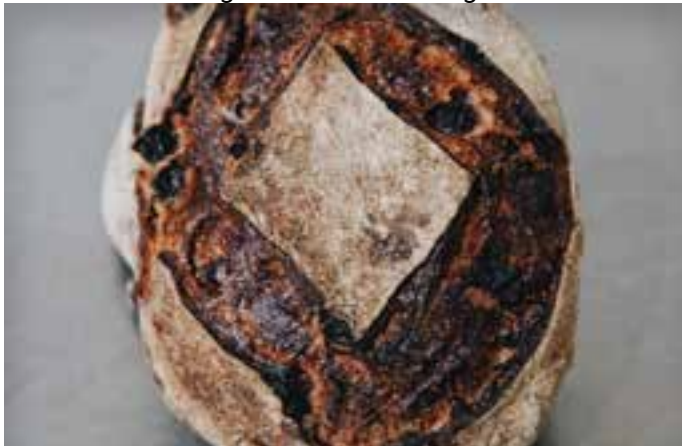
Fig And Walnut Small