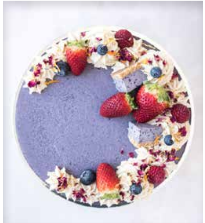
Blueberry & Lemon Cheesecake