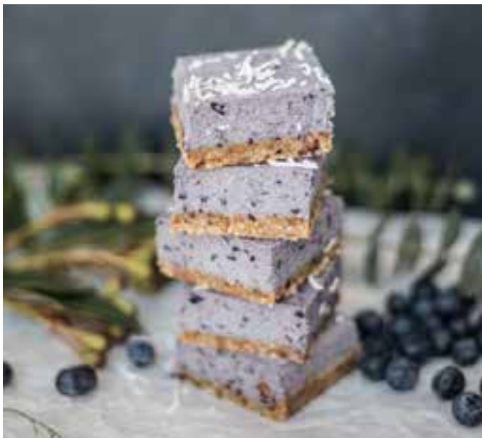
16x Blueberry Slices