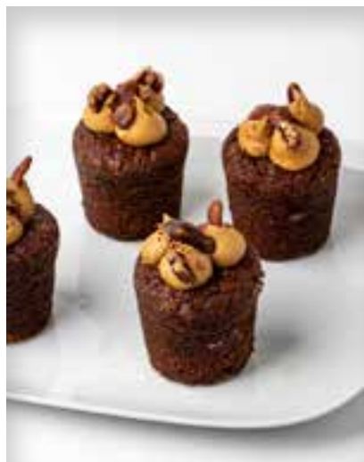
Date Pecan and Espresso Cake