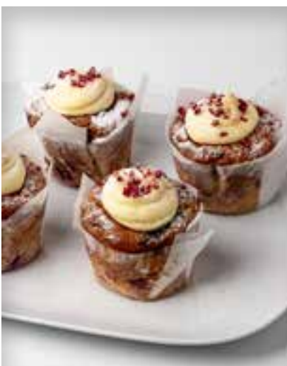
Raspberry and White Chocolate Muffin