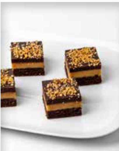
Chocolate Salted Caramel and Hazelnut Slice