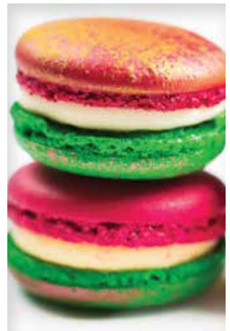
Lychee and Rose