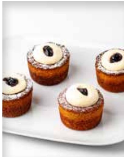
Lemon and Blackcurrant Cake