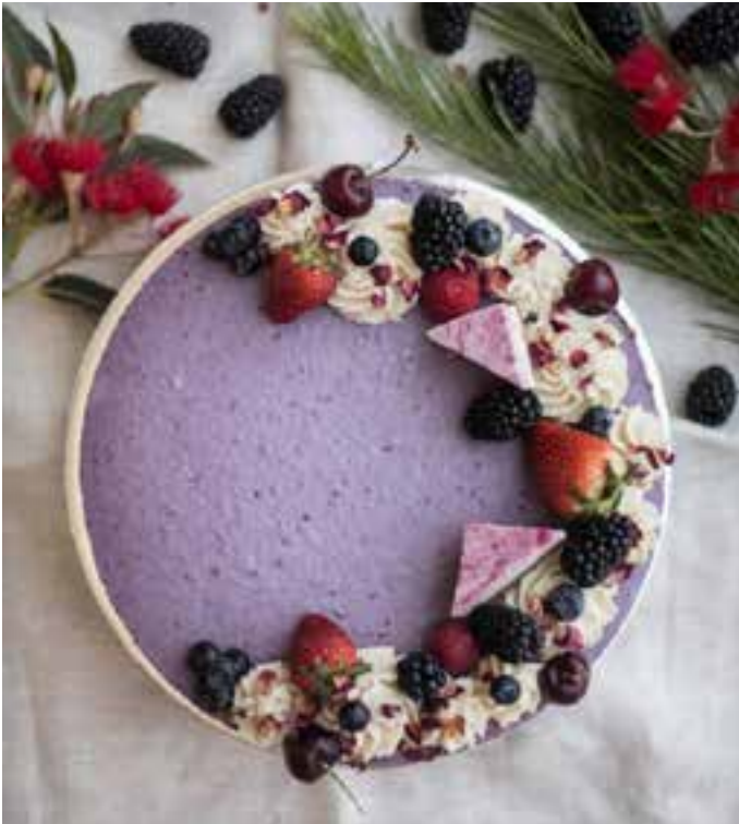
Blackberry Vanilla & Lavender