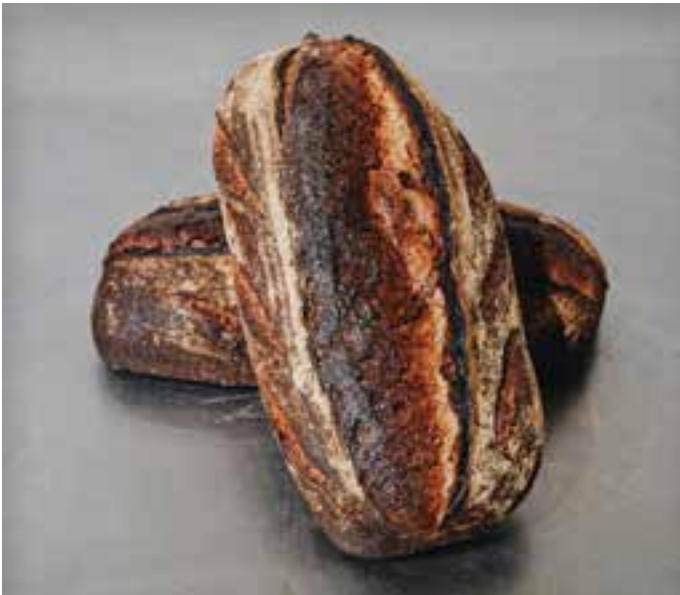
Rye Caraway Large