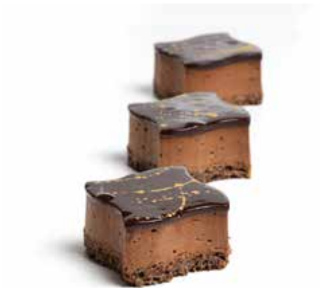
Chocolate Crunchy 🌱