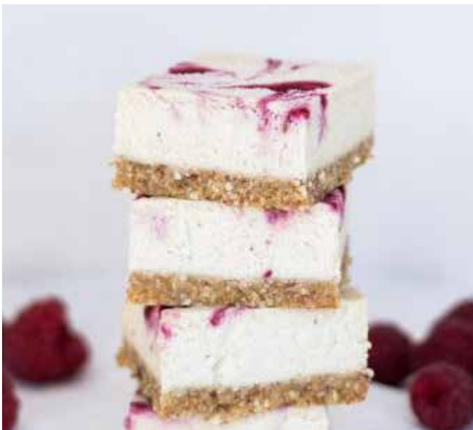
16x Vegan Raspberry & Vanilla RAW Slices