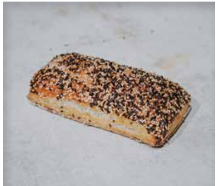
Ciabatta Seeded Rectangle