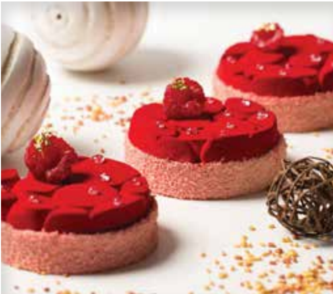
Lychee, Raspberry and Rose Tart