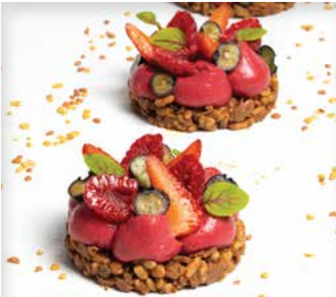
Summer Berries Rice Crispy