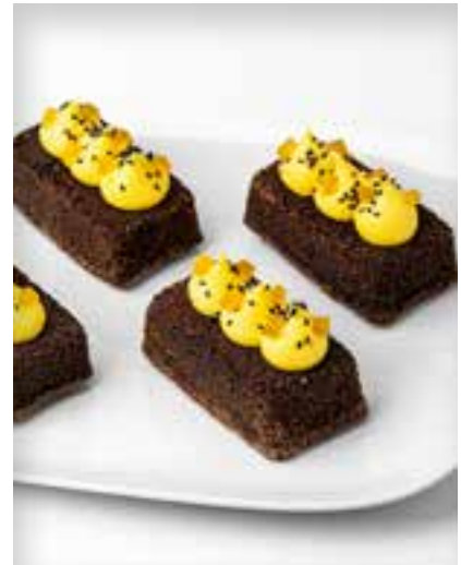
Black Sesame and Yuzu Cake