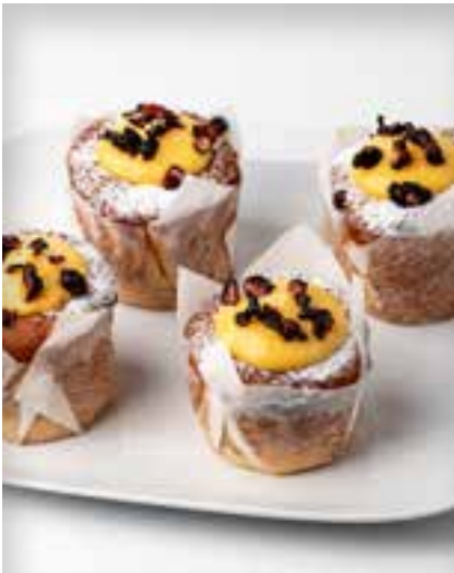
Blueberry and Lemon Muffin