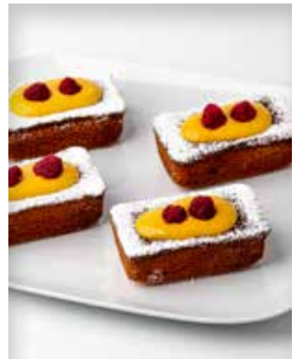
Raspberry and Passionfruit Cake